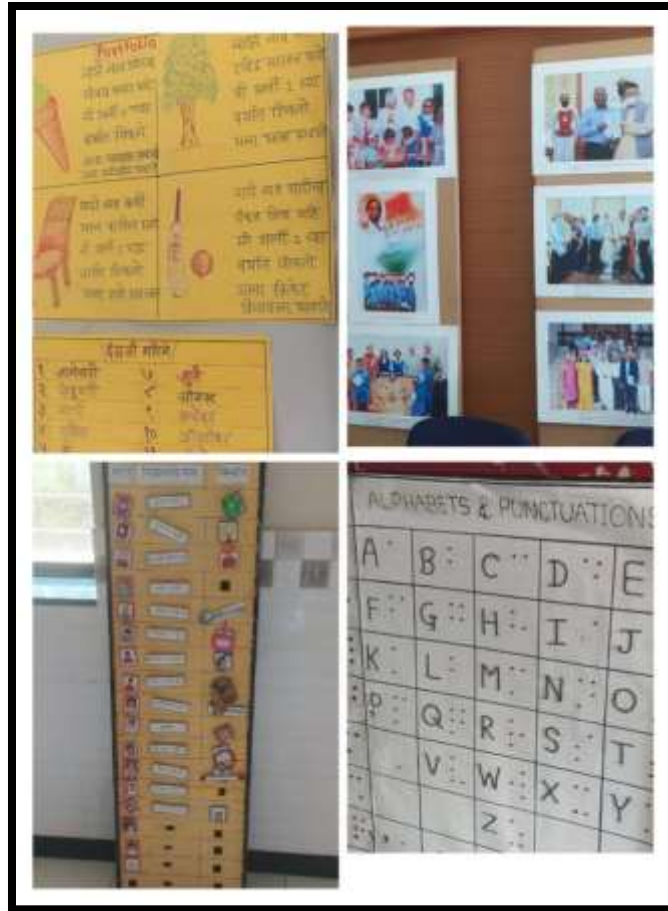
Additional Aid for specialized learning