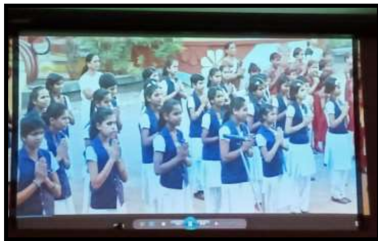
The students were shown the documentary film about NAB